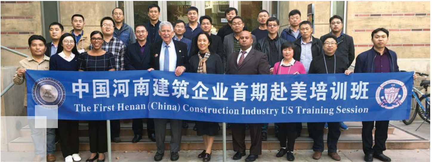
Construction Management's Executive Training Programs