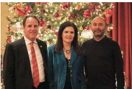
The CEE Holiday Party